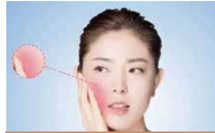
Frequent itching and peeling