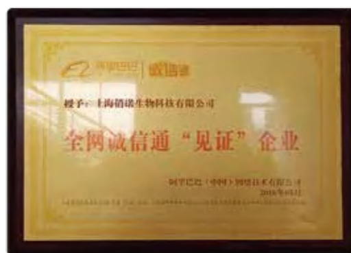
Witness Enterprises with Integrity Across the Internet