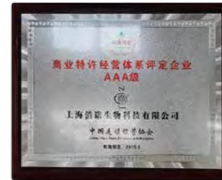
Business franchising system evaluation enterprise AAA Level