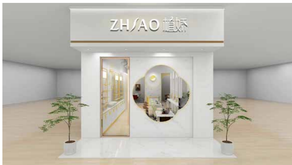
Design rendering of physical stores