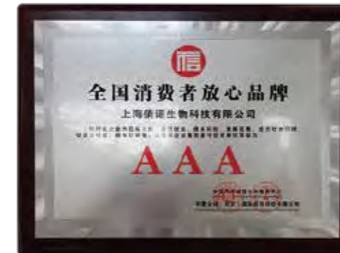
National Consumer Trust Brand AAA