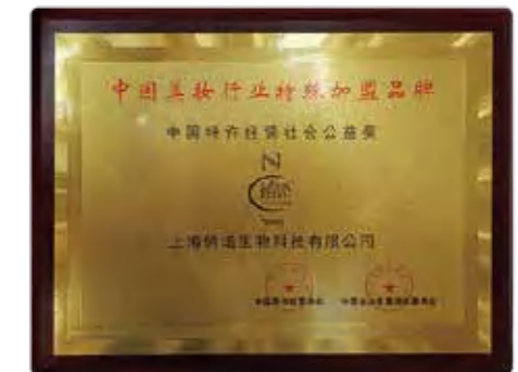
Special franchise brands in China's beauty industry