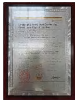
Good Manufacturing Practice Certification for Cosmetics