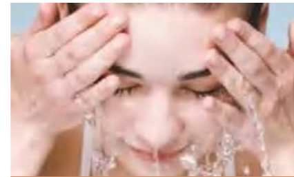
Lock hydraulic pressure difference