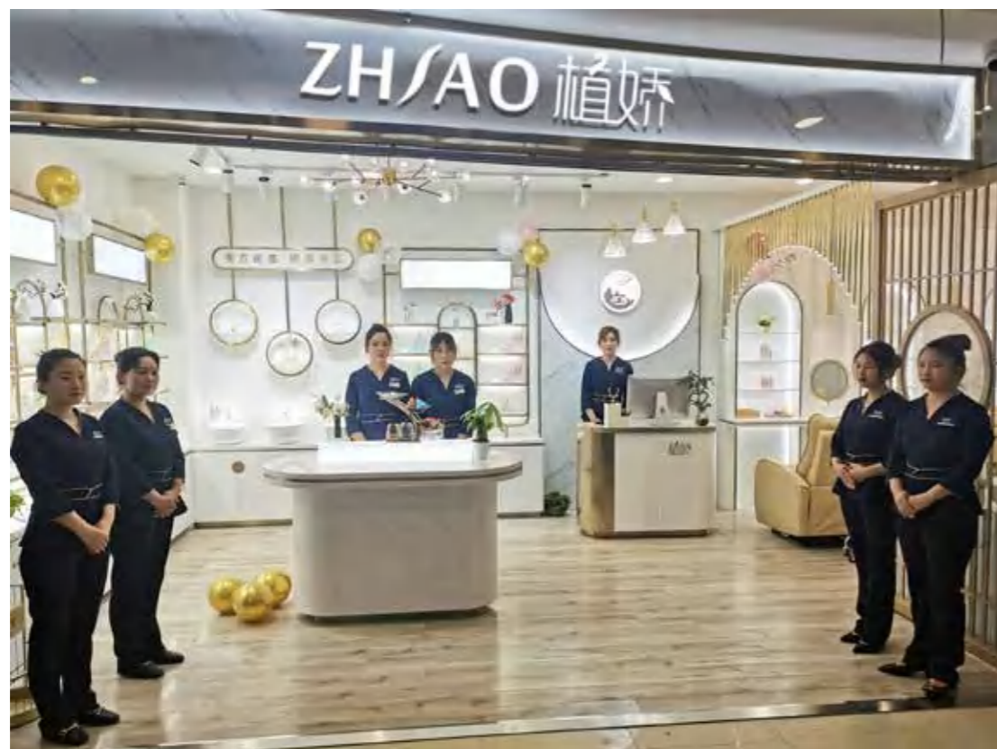
Physical store installation