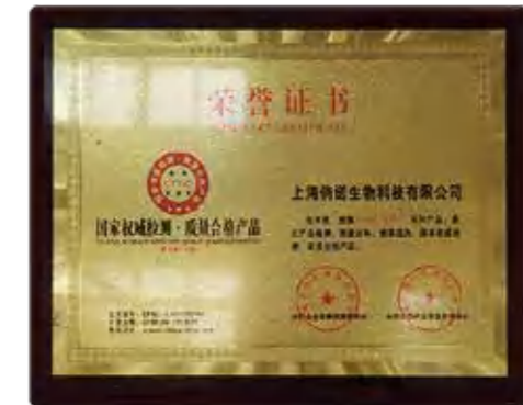
National authoritative testing Quality qualified products