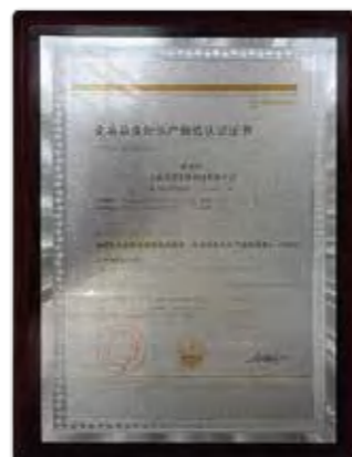
Good Manufacturing Practice Certification for Cosmetics