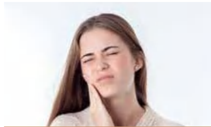
Dry and tight